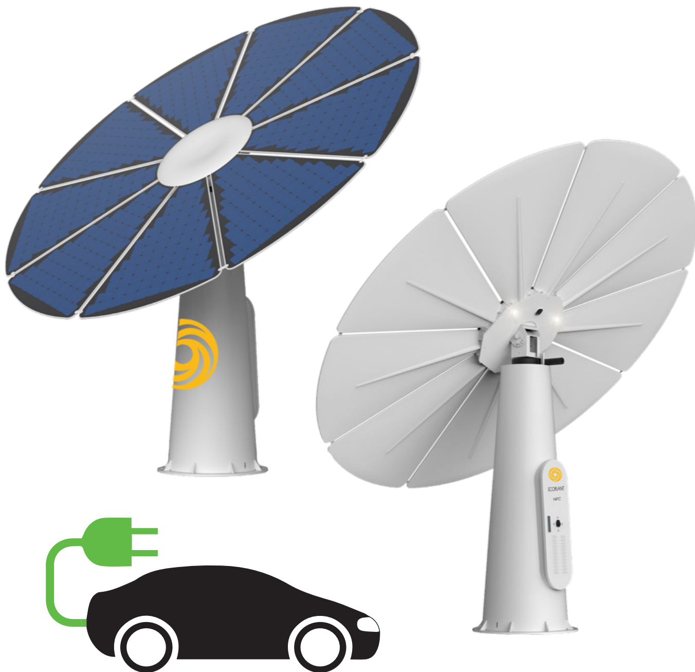
PHLX 50000 Hybride